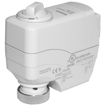
SSC81U Electronic Valve Actuator.

24 Vac, Floating Control Spring Return or Non-Spring Return